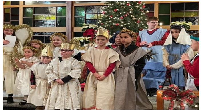
Kids Christmas Eve Play

The Menominee Unit hosted a Trunk or Treat in October!