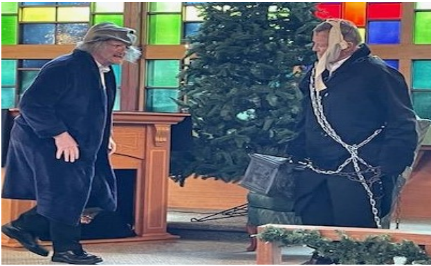
Scrooge & Marley