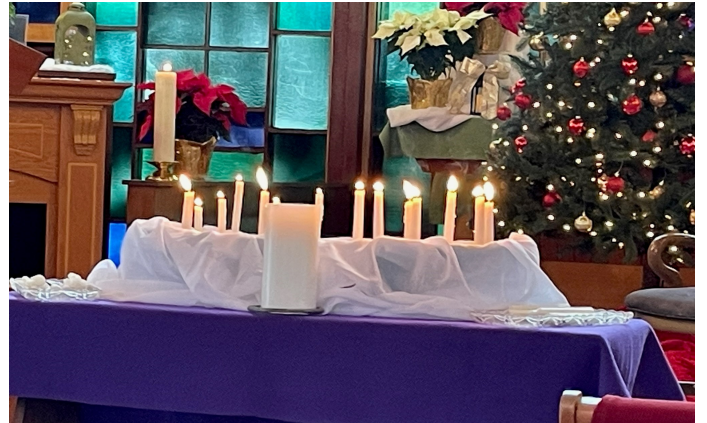
Blue Christmas Service